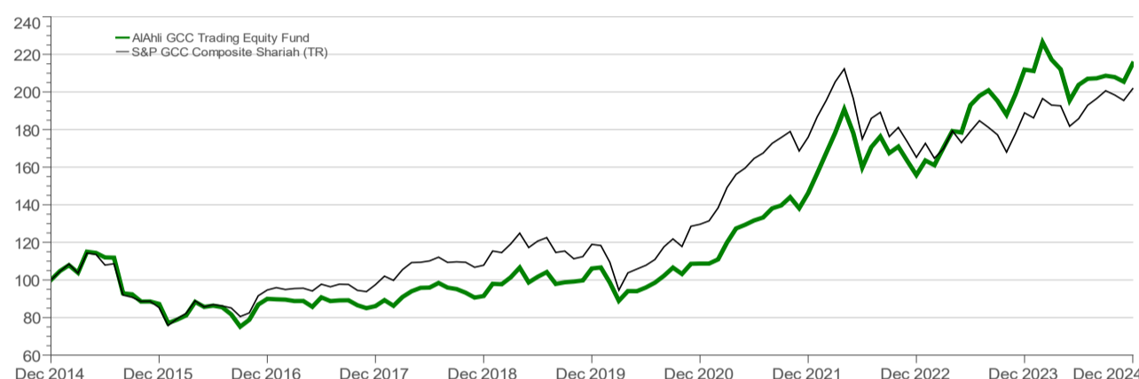
Manager Performance January 2015 - December 2024 (Single Computation)